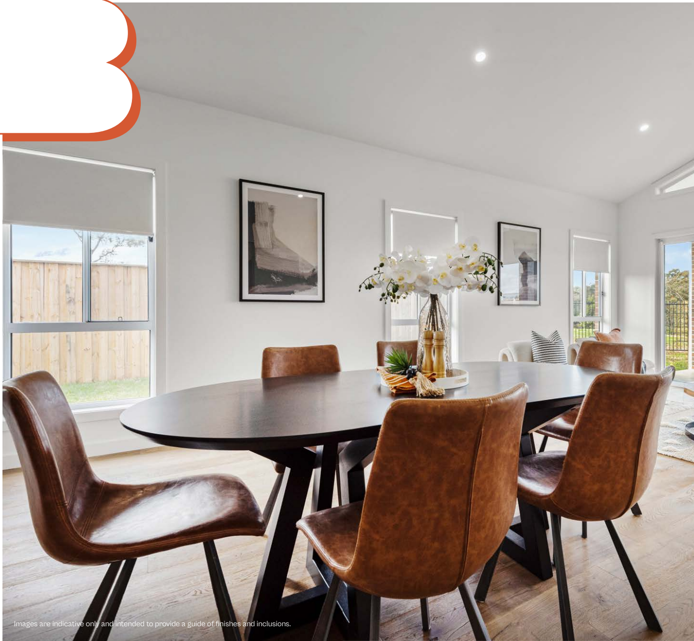
Images are indicative only and intended to provide a guide of finishes and inclusions.