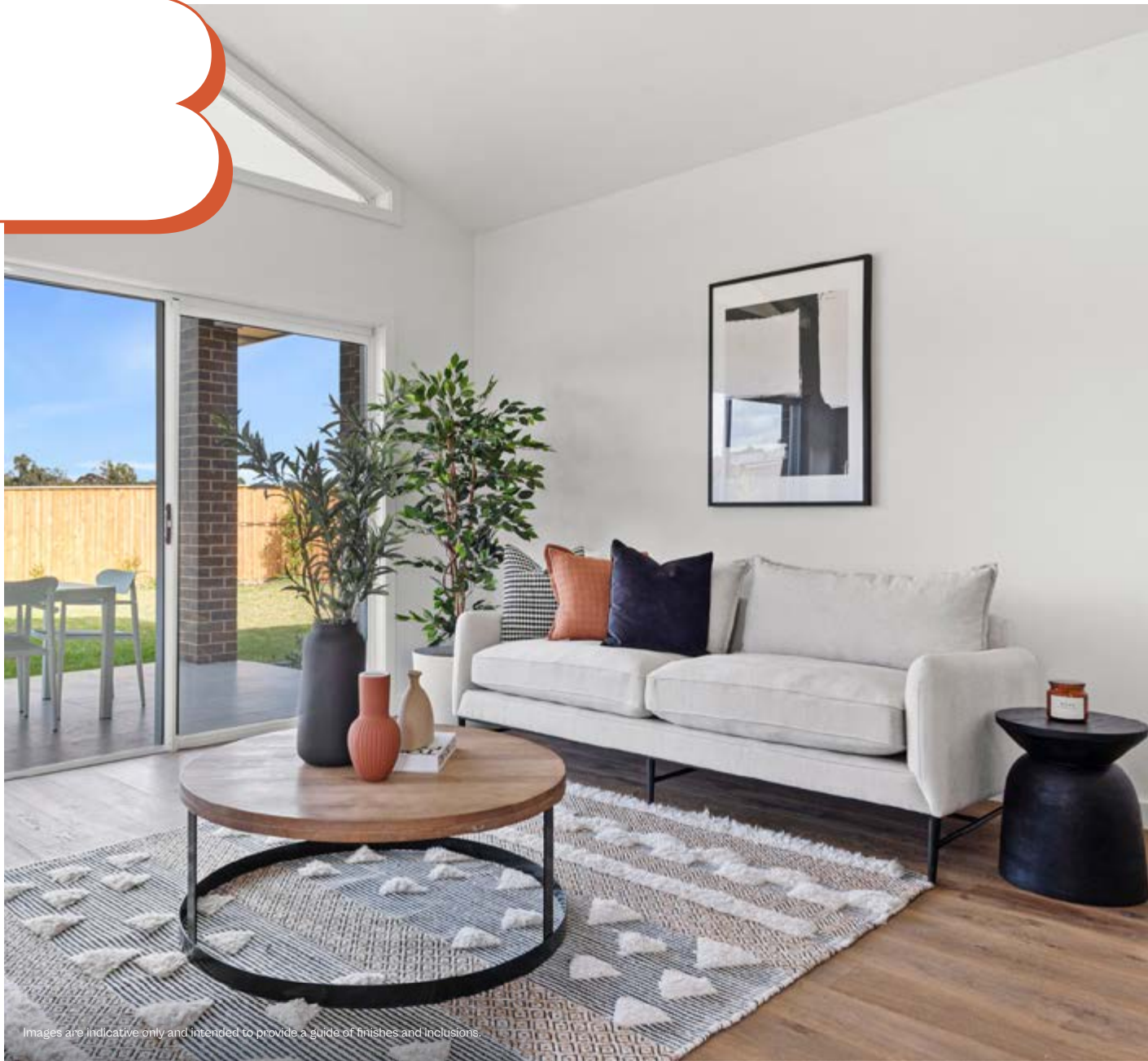
Images are indicative only and intended to provide a guide of finishes and inclusions.